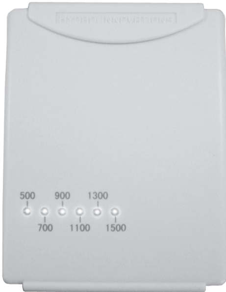
CO 2 Monitor Unit

Hydro Innovations is now offering a high quality yet extremely affordable CO 2 monitor. The product features a maintenance-free SenseAir® brand gas detector, which after extensive testing we have found to be the most accurate sensor available. The cost savings are not as a result of cutting corners on the accuracy or function of the unit, it is because our unit is simplified and lacks a lot of the frequently unused bells and whistles that other monitors have. Our monitor is not adjustable and comes preset to turn on at 1300 PPM and off at 1500 PPM. Simple indicator lights show the current CO 2 levels instead of a digital screen. Our monitor comes with a piggyback plug, allowing it to be used with any brand generator. We also supply our easy-mount wall bracket to make installation as easy as it can be. The simplicity of our monitor makes it the most user-friendly CO 2 monitor available.