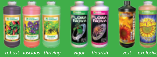
robust luscious thriving vigor flourish zest explosive

Keep it simple and enjoy your thriving garden.