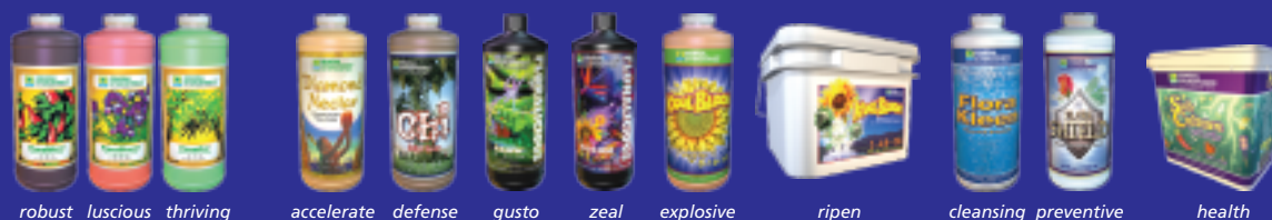
robust luscious thriving accelerate defense gusto zeal explosive ripen cleansing preventive health

Liquid KoolBloom® goes way beyond your typical bloom booster. Enriched with stress reducing vitamins and nutrient transporting acids, Liquid Kool Bloom promotes production of essential oils, enhances flavor, and increases fruiting and flower development. Finally, add Dry KoolBloom® in the last two weeks for optimal weight gain and ripening to perfection.